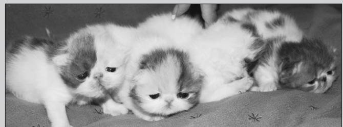
Persian kittens cuddle with one another.

According to the Cat Fanciers Association, Persians are in the top 10 of most popular cat breeds. Persians, with their long flowing coats and open, pansy-like faces, have sweet, gentle personalities. Their long coats require proper maintenance to prevent tangles and hairballs. An occasional bath will keep the coat clean, healthy and beautiful. The large eyes are prone to tearing, so a daily face wash is recommended. Keeping a Persian indoors keeps it safe from disease and the dangers of urban life.