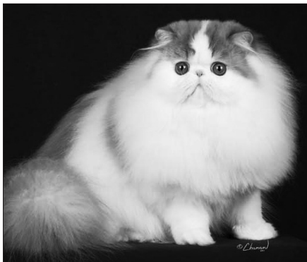
Hear Me Roar, fondly called Roary, was named the Cat Fanciers Association Cat of the Year for 2010-11. He also has earned titles as grand champion, breed winner and national winner.